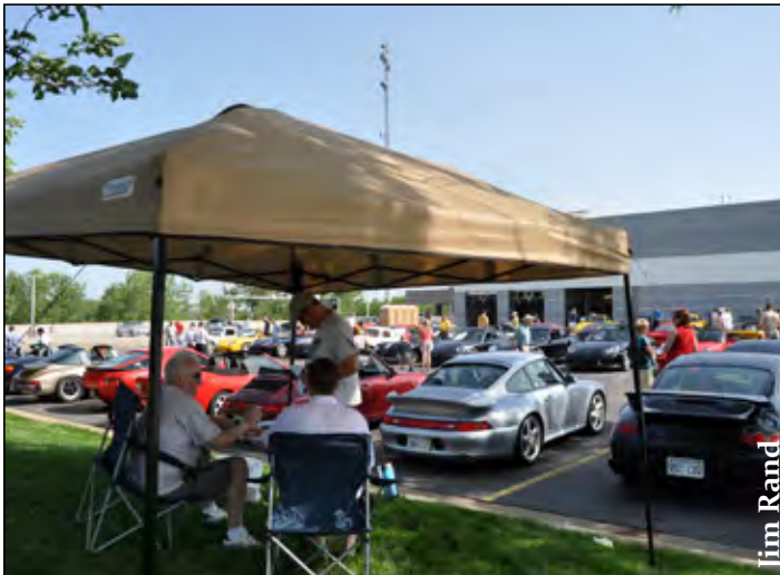
Porsche was the dominant marque at the Aristocrat car show.