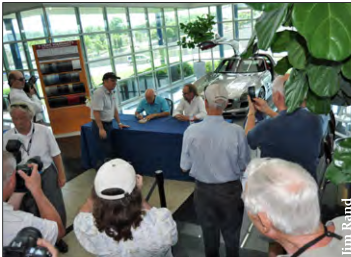
Sir Stirling Moss signing autographs for an appreciative crowd.