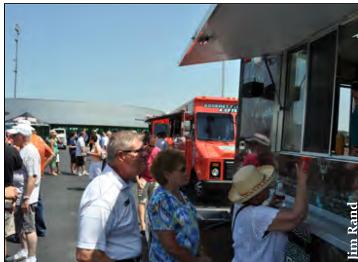
Food trucks offered tasty entrées prepared by first-rate chefs.