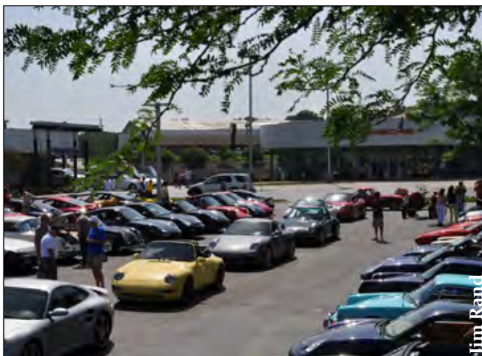
After lunch 33 Porsches queue up for the Fun Drive.