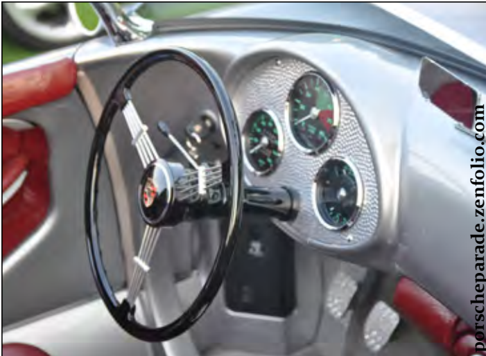
An immaculate Porsche on display at the concours event.