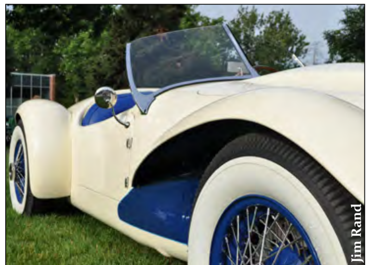
A 1950 Dierdt Rochester Special Roadster.