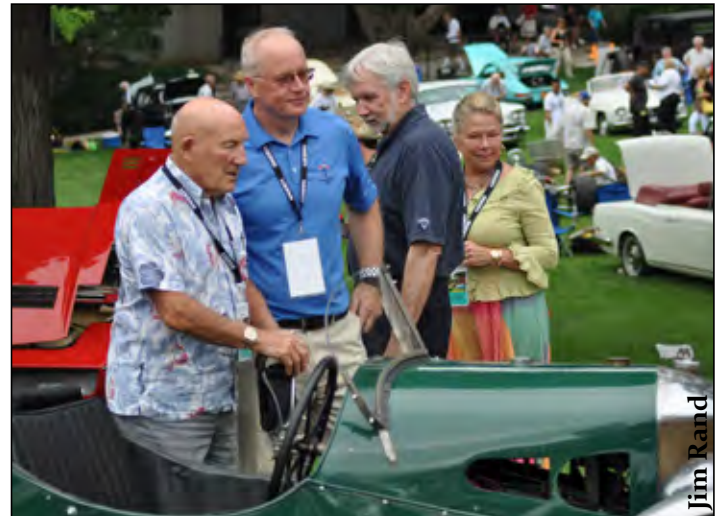
Sir Stirling Moss was a special guest at this year's event.