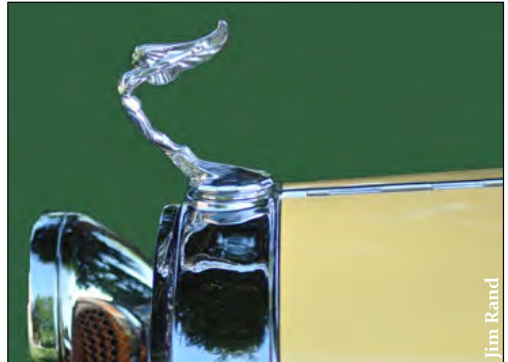
The art of the car captured in a classic hood ornament.