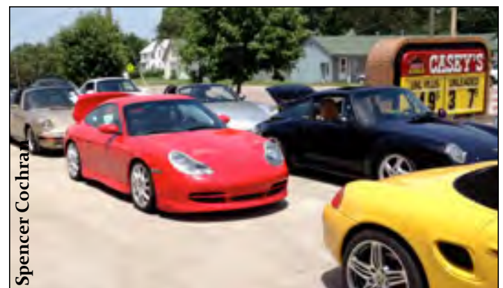
Fun Drive participants regroup at Casey's in Tonganoxie, KS.