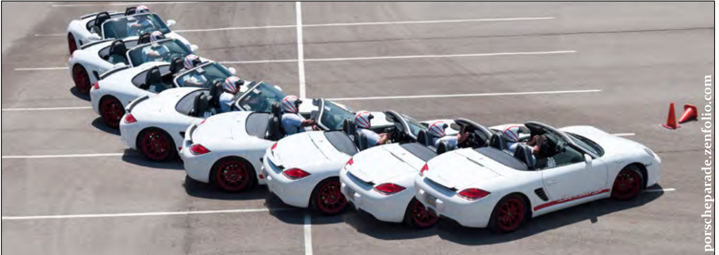
A time-lapse photo from the autocross event.