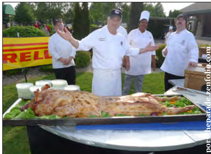
As usual the PCA Parade organizers went whole hog.