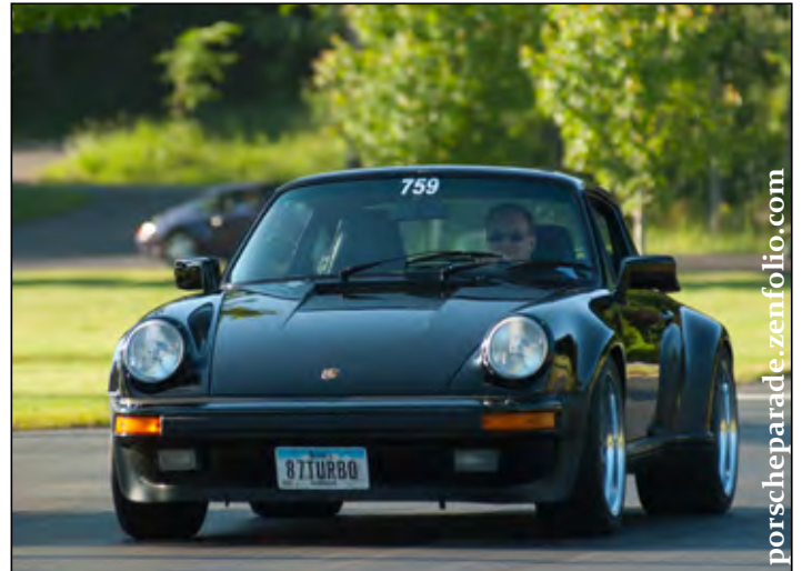
The TSD Rally and driving tours are always popular.