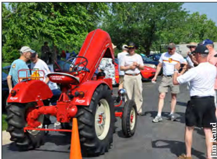
The Porsche tractor always draws a crowd.