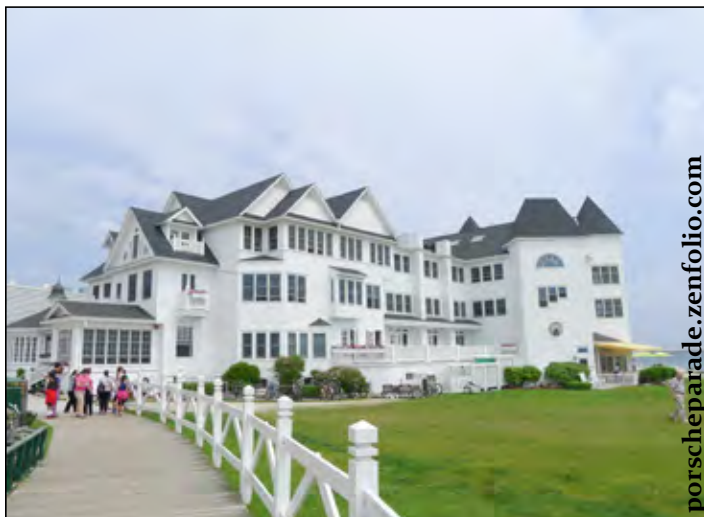
Mackinac Island Tour.