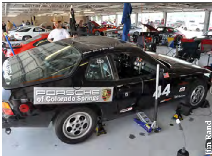
The club racers loved the facilities at Kansas Speedway.