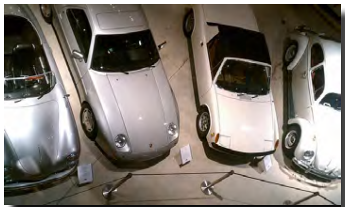
Three Porsches and a long lost cousin on display at the Barber Motorsports Museum.