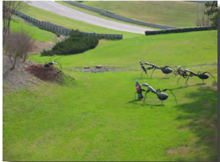
The immaculately manicured grounds at Barber Motorsports Park feature an eclectic mix of art sculptures.

It's on the track that the skill levels of the various run groups become clearly evident as there were multiple occasions where our group had to slow down to let a slower group move ahead (no passing allowed). One group was so slow that we caught up in less than two laps even though they had nearly