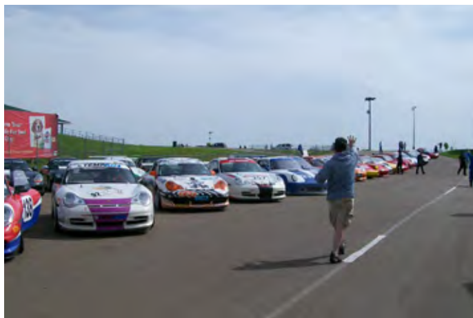
A successful Club Race requires both sponsors and volunteers.