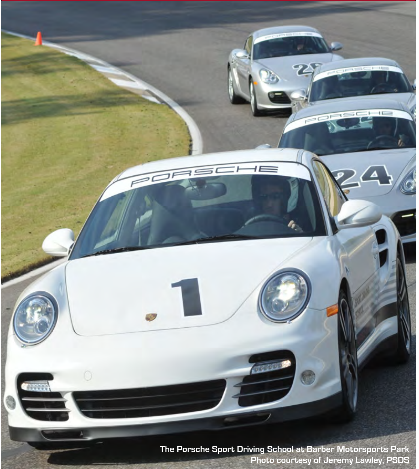
The Porsche Sport Driving School at Barber Motorsports Park