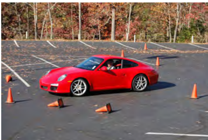
Sunday morning Vic Elford makes a run on the autocross.

Best of all, you'll be able to read the newsletter a few days before the rest of the club receives their copies in the mail—and the photos are in color!