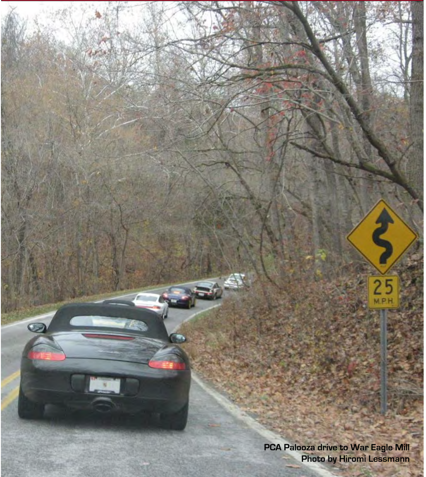
PCA Palooza drive to War Eagle Mill