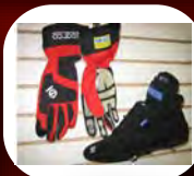
Shoes and Gloves