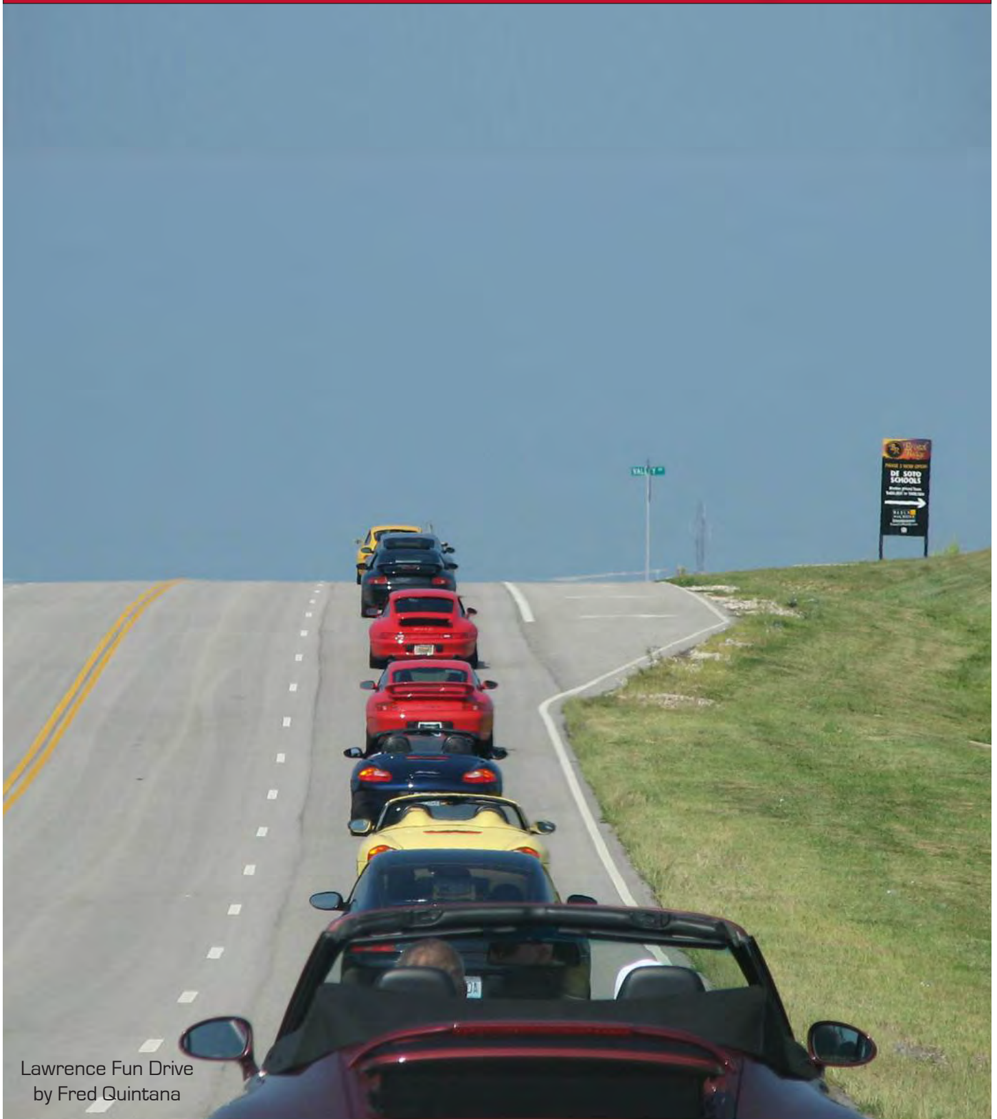
Lawrence Fun Drive