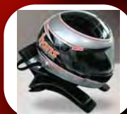
SA Helmets & HANS

You qualify for SPONSORSHIP when you place Apex SPG stickers or windshield banners on your vehicle. "CALL FOR DETAILS"