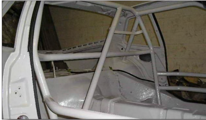
Installed Roll Cage

older race cars. There are numerous sources for roll cages out there, including but not limited to Hanksville hotrods (custom cages), Autopower Industries, and Safety Devices, or have your own cage custom made following the requirements laid out by NASA. Expect to pay anywhere from $800-1500 for the cage, plus install.