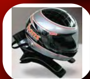
SA Helmets & HANS

You qualify for SPONSORSHIP when you place Apex SPG stickers or windshield banners on your vehicle. "CALL FOR DETAILS"