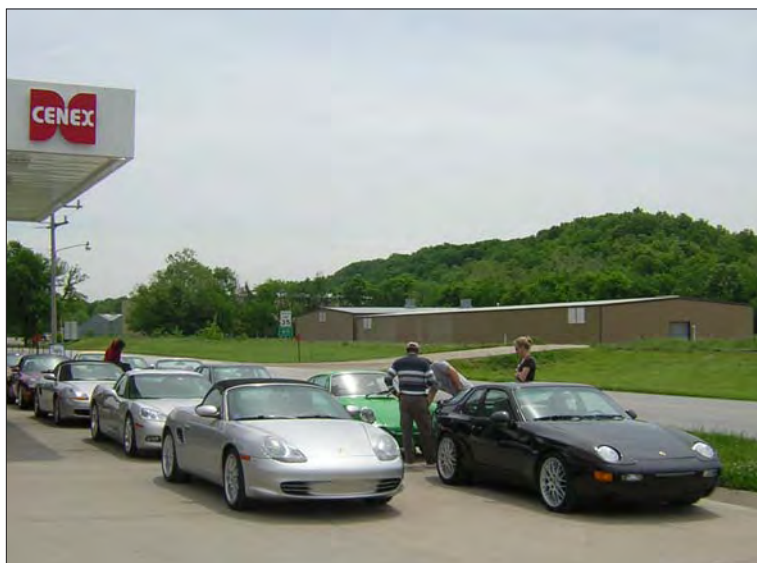
A Much-Needed Rest Stop