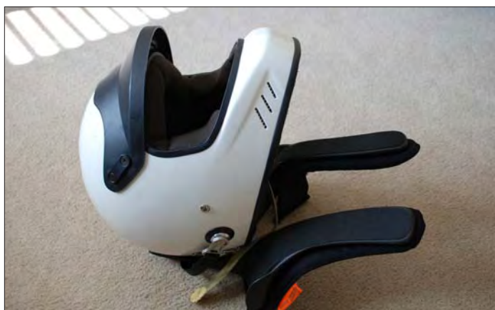
Helmet and Hans Device

Next obvious item of extreme importance is the roll cage. NASA requires a 6 point full roll cage with driver's dual side bars and passenger single bar (dual is recommended, but not required). The roll cage is designed to protect the occupants in the event of .....you guessed it, a rollover accident. The roll cage must be able to support the weight of the car when laying upside down on it's roof, and the tubing requirements can be found on NASA's website depending on the weight of your vehicle. The cage must be padded everywhere that it is possible for the driver's helmet/head to come in contact with the cage. SFI 45.1 padding is required, which is a high-density foam, unlike the traditional full wrap soft foam you use to see in