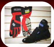
Shoes and Gloves