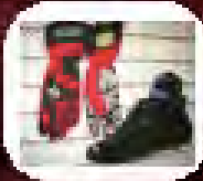
Shoes and Gloves