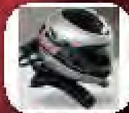
SA Helmets & HANS

You qualify for SPONSORSHIP when you place Apex SPG stickers or windshield banners on your vehicle. "CALL FOR DETAILS"