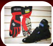
Shoes and Gloves