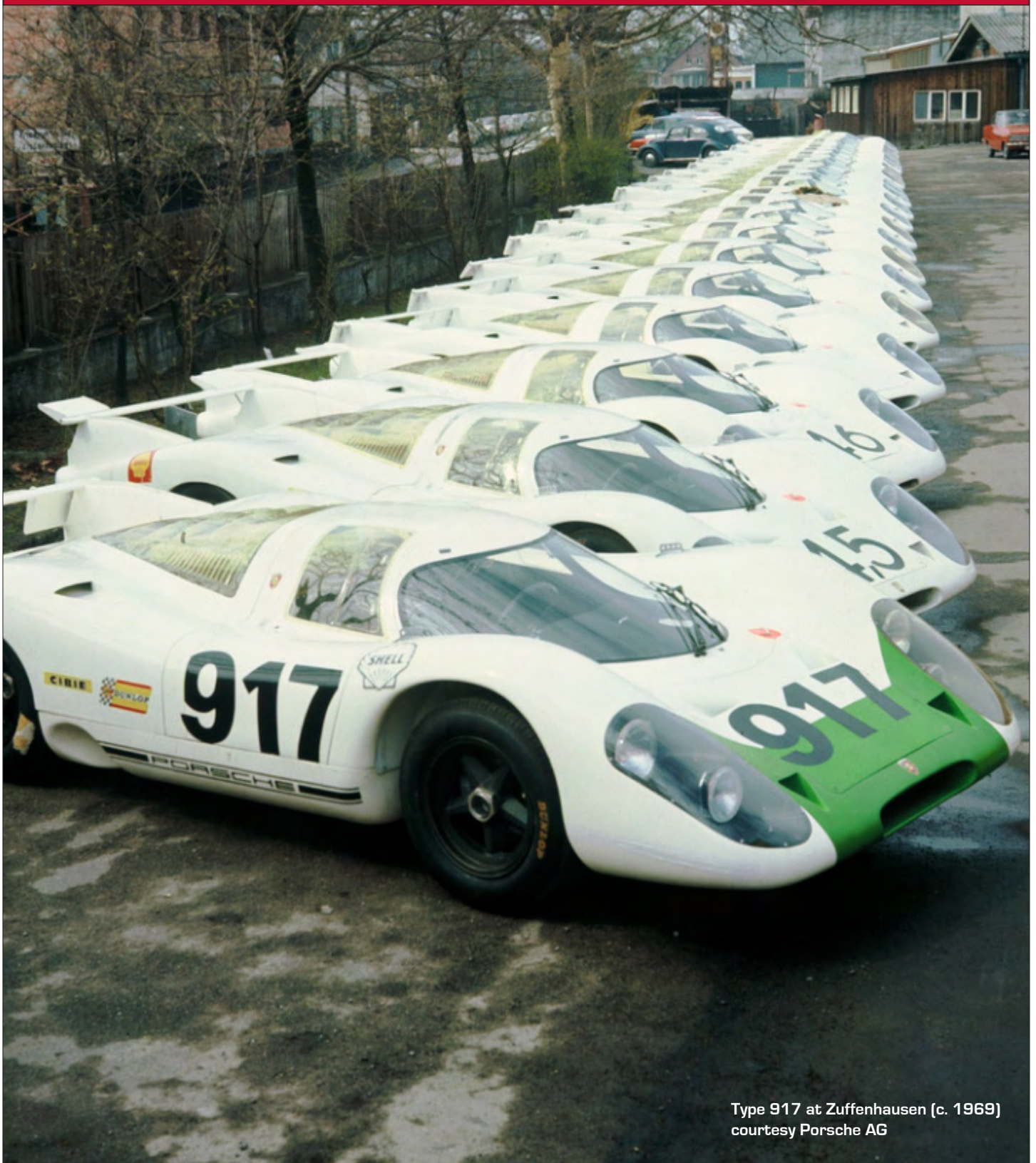
Type 917 at Zuffenhausen (c. 1969)