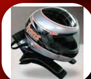
SA Helmets & HANS

You qualify for SPONSORSHIP when you place Apex SPG stickers or windshield banners on your vehicle. "CALL FOR DETAILS"